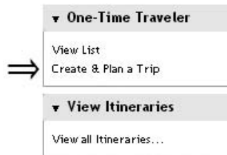
The Trip Manager menu (see page 2 for the entire screen that appears).

Enter the traveler's profile information (see page 2).